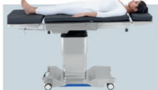
Height adjustment up/down