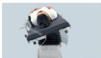
Lateral tilt left/right